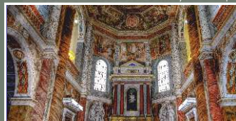
St. Aloysius Chapel