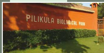
Pilikula Biological Park