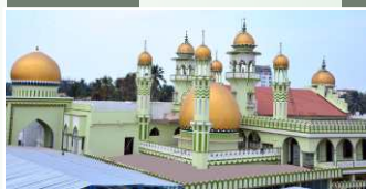
Sayyed Madani Darga - Utlal