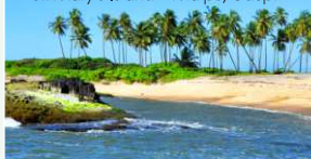
St. Mary's Island - Malpe, Udupi